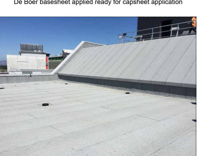
Completed DuO capsheet application