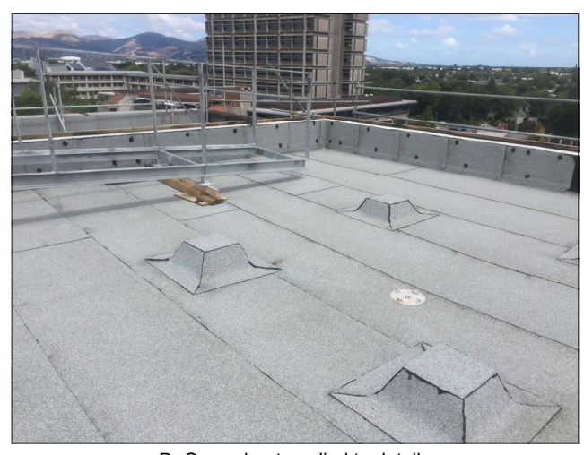
DuO caosheet applied to details