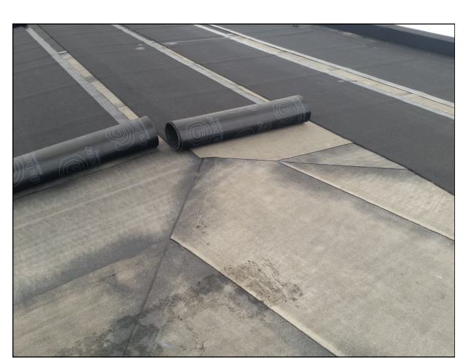
DuO AGR Capsheet installed over basesheet