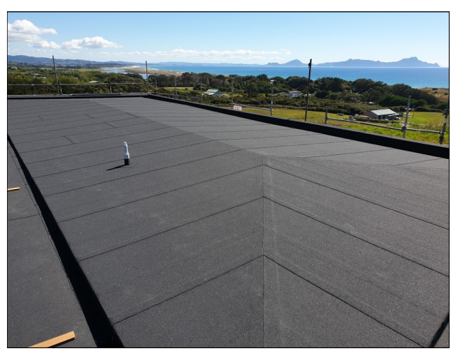
Finished DuO capsheet application

Project Name: Private Residence - Waipu Cove