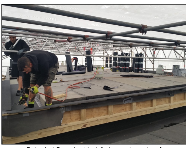
Deboplast Basesheet installed over plywood roof