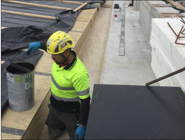
Primer application on plywood substrate