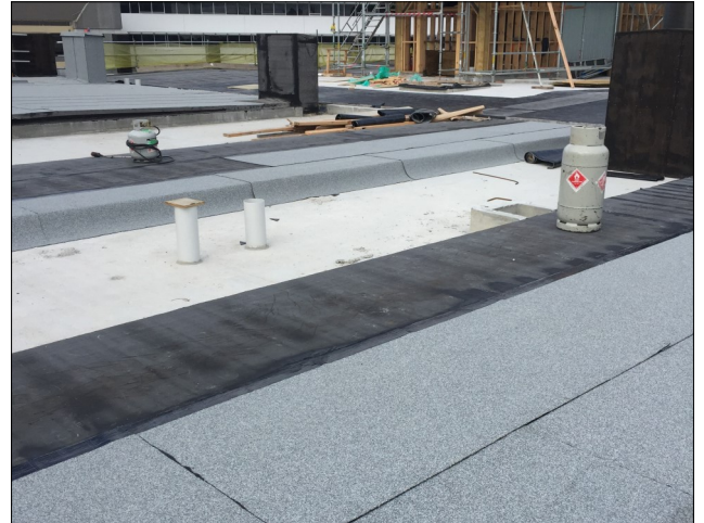
DuO Capsheet installation