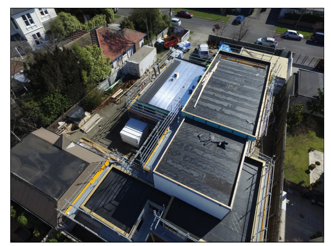
Vapour barrier installed over plywood substrate