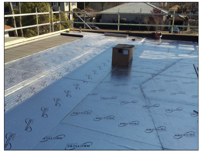
Recticel PIR insulation board installed over vapour barrier

PO Box 601, Blenheim , New Zealand Email: info@equus.co.nz