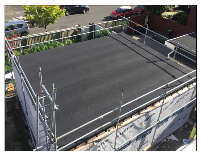
De Boer DuO AGR capsheet application

Project Name: Private Residence Location: Christchurch Project Type: Residential Project Size: 310 sqm System: Equus De Boer DuOtherm Warm Roof System on Plywood Certified Applicator: H2OFF