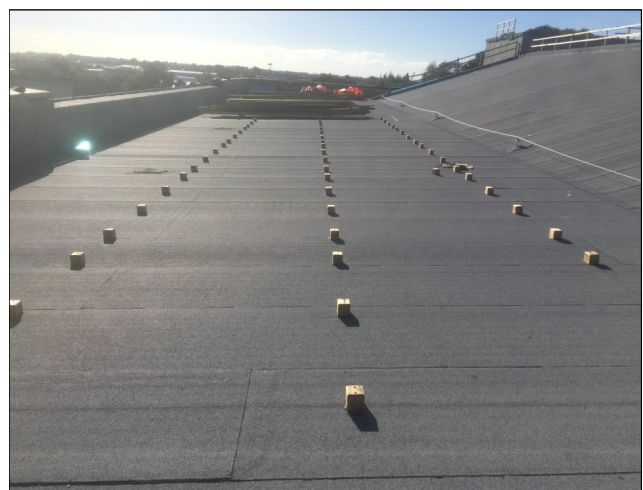
Finished DuO capsheet application with nib installation for Solar Panels

Project Name: Kahukura (K Block), Ara Institute of