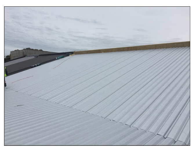
Metal substrate ready for warm roof installation