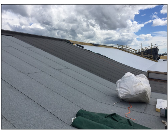
De Boer DuO capsheet application