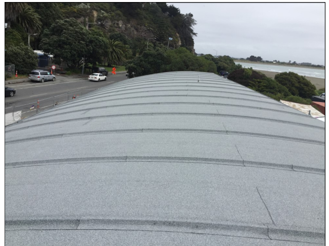
Finished top roof