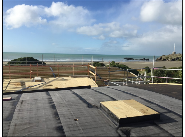
Installation of the DuO basesheet over plywood