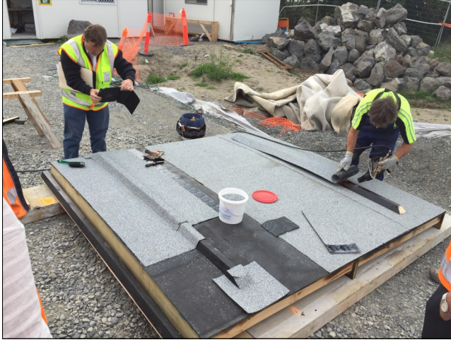
Preparation of the DuO mock roof