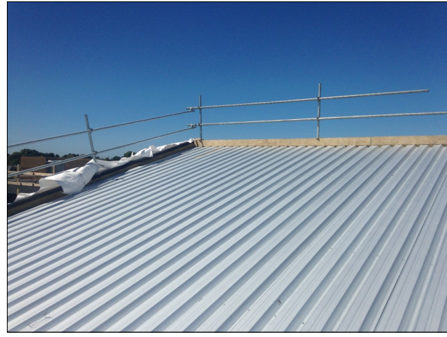
Metal tray roof ready for warm roof application