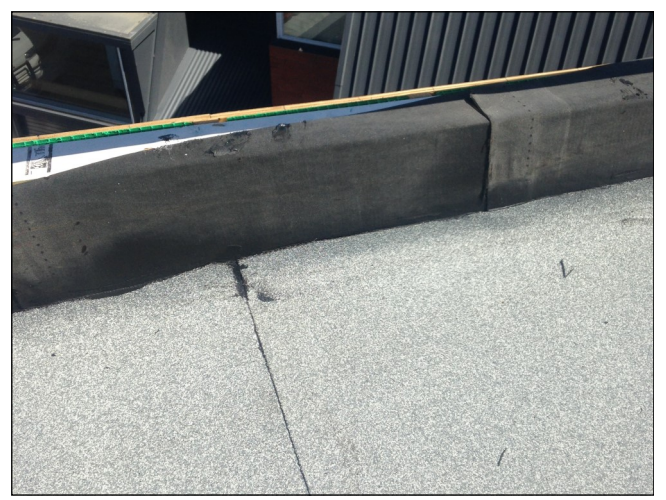
DuO capsheet application