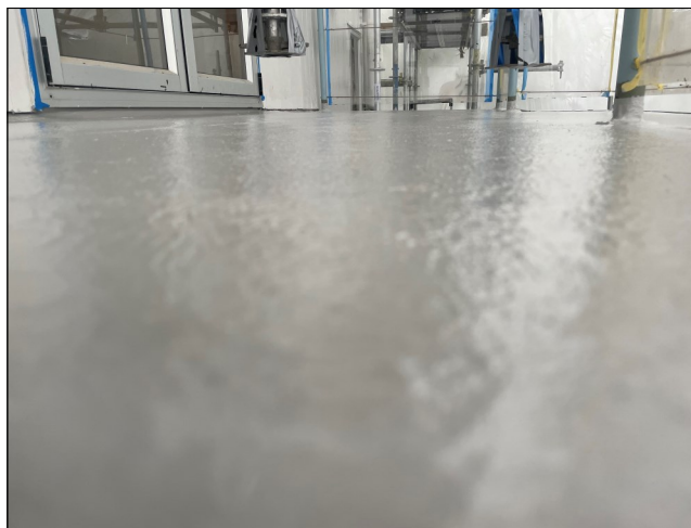
Final result after applying second layer of topcoat.