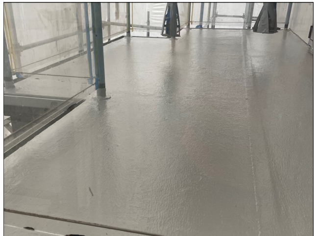
Application of first layer of topcoat over cured EASY FLASHING.