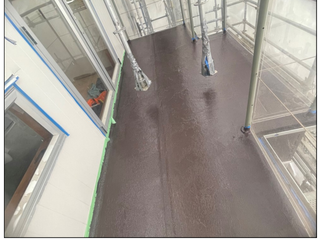
Application of first layer of EASY FLASHING with reinforcement.