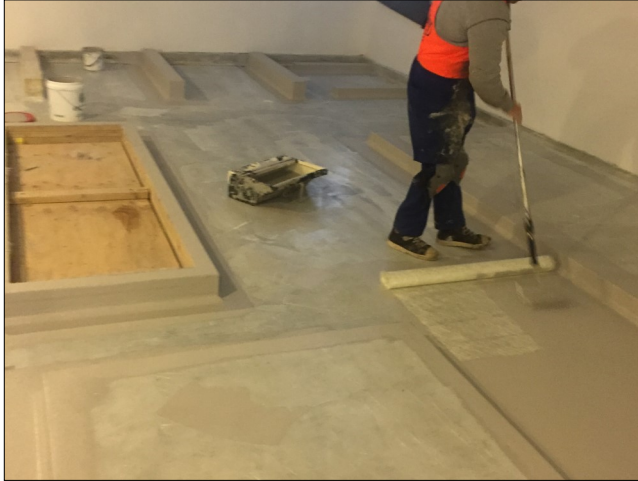
Fibreglass reinforcement laid into wet Chevaline Dexx bodycoat