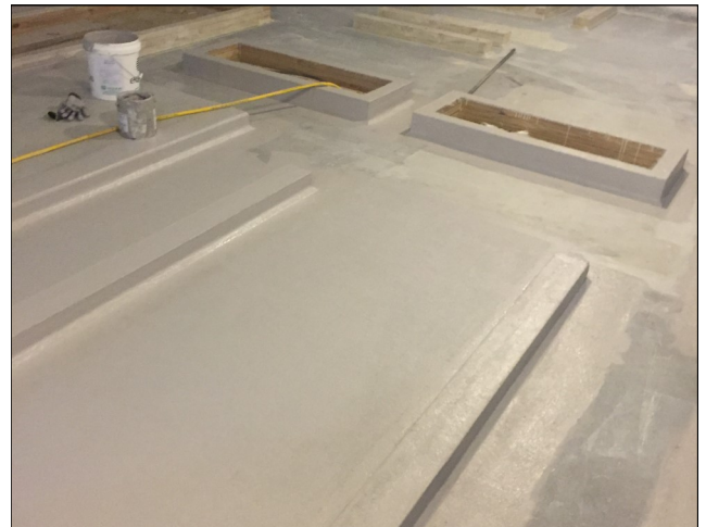
Application of Chevaline Dexx Bodycoat to detailing