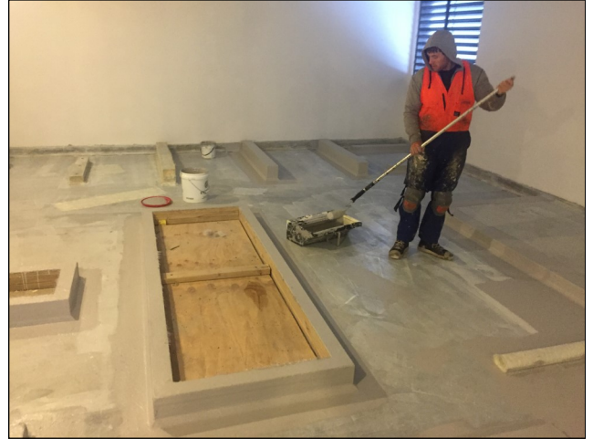
Application of Chevaline Dexx bodycoat