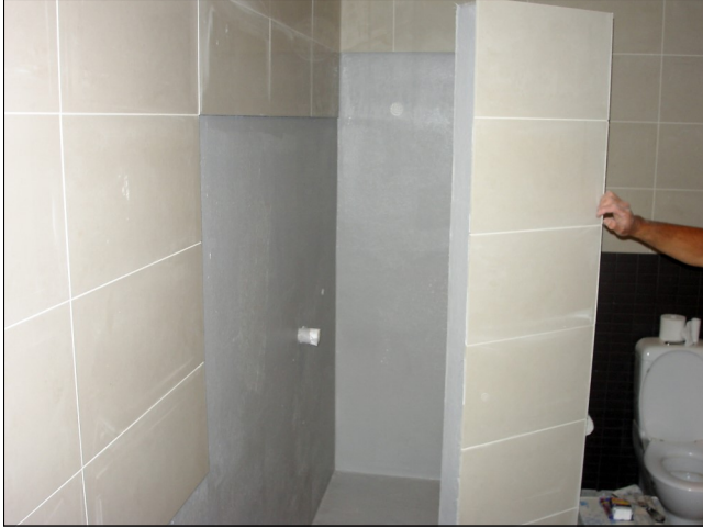
Chevaline Dexx Membrane applied to shower walls and floor