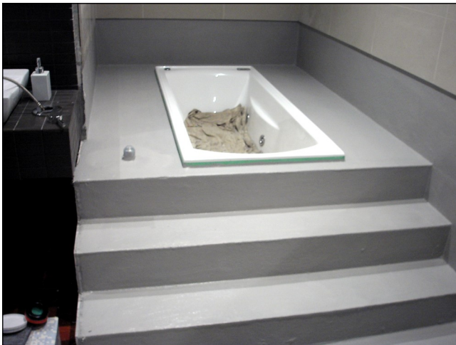
Chevaline Dexx Membrane applied to bath walls, steps and floor