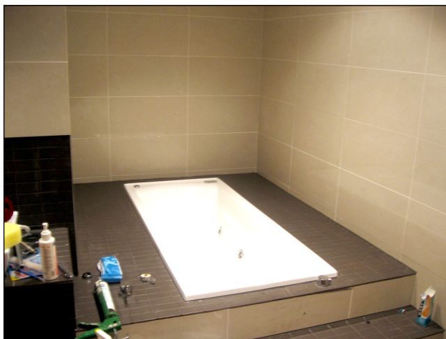
Installation of tiles over Chevaline Dexx in bath area