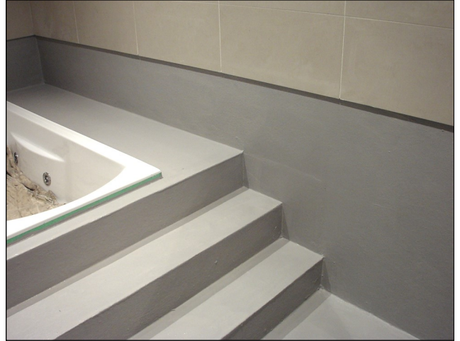
Chevaline Dexx Membrane applied to bath walls, steps and floor