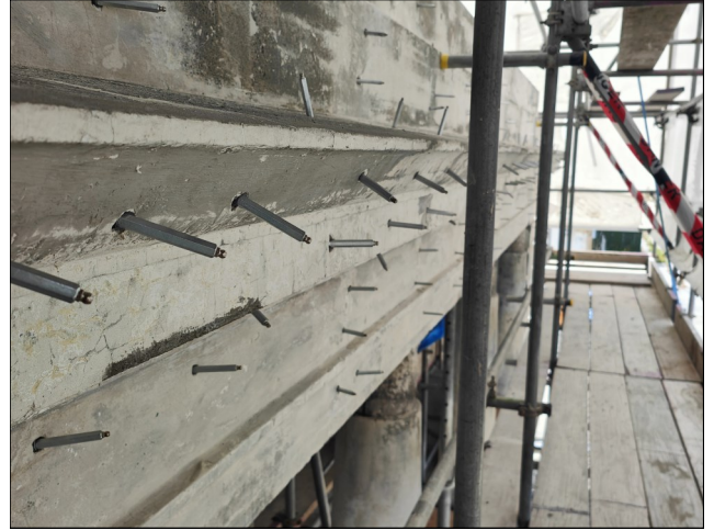
Crack injection before paint application