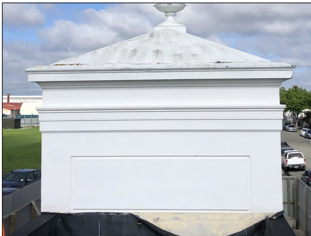
Primed with Chevaprime-U and Coverflexx application