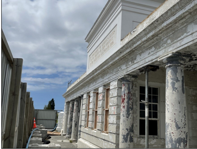
Before preparation has started