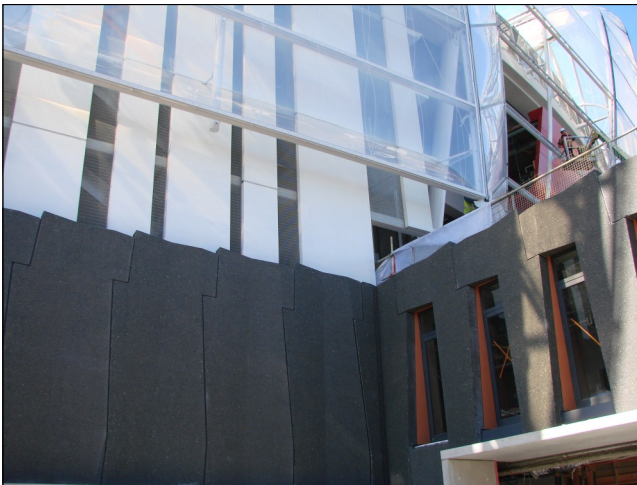
Finished Keim coatings applied to concrete