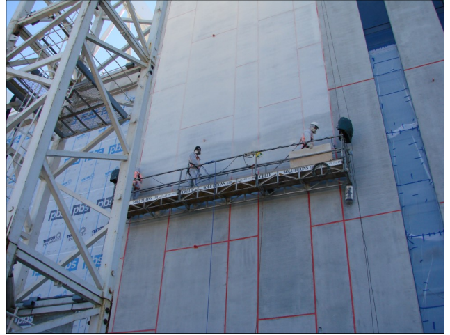
Keim Concretal Lasur coating application to concrete panels