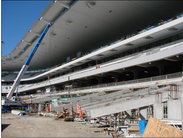
Construction of South Stand