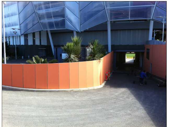
Finished Keim coatings to entrance barriers