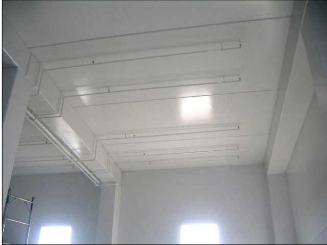
Chevaline Colourglaze to interior walls