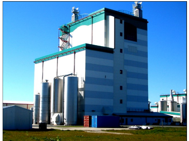
Chevaline Colourglaze to exterior